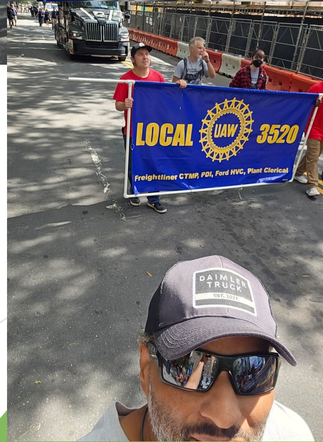
2024 Charlotte Labor Day Parade